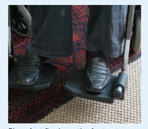
Place feet firmly on the footrests.