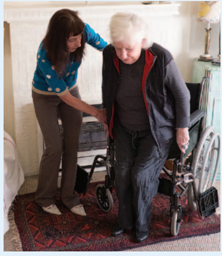
Bend forward at your waist and slowly lower onto the chair.