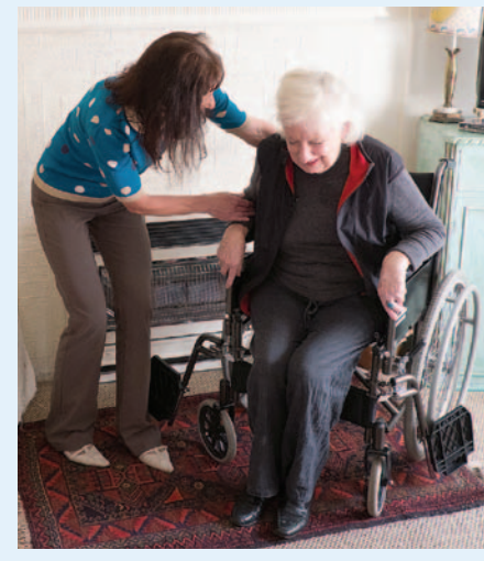
Feel the front of chair at the back of your knees and grab onto the armrests evenly with each hand.